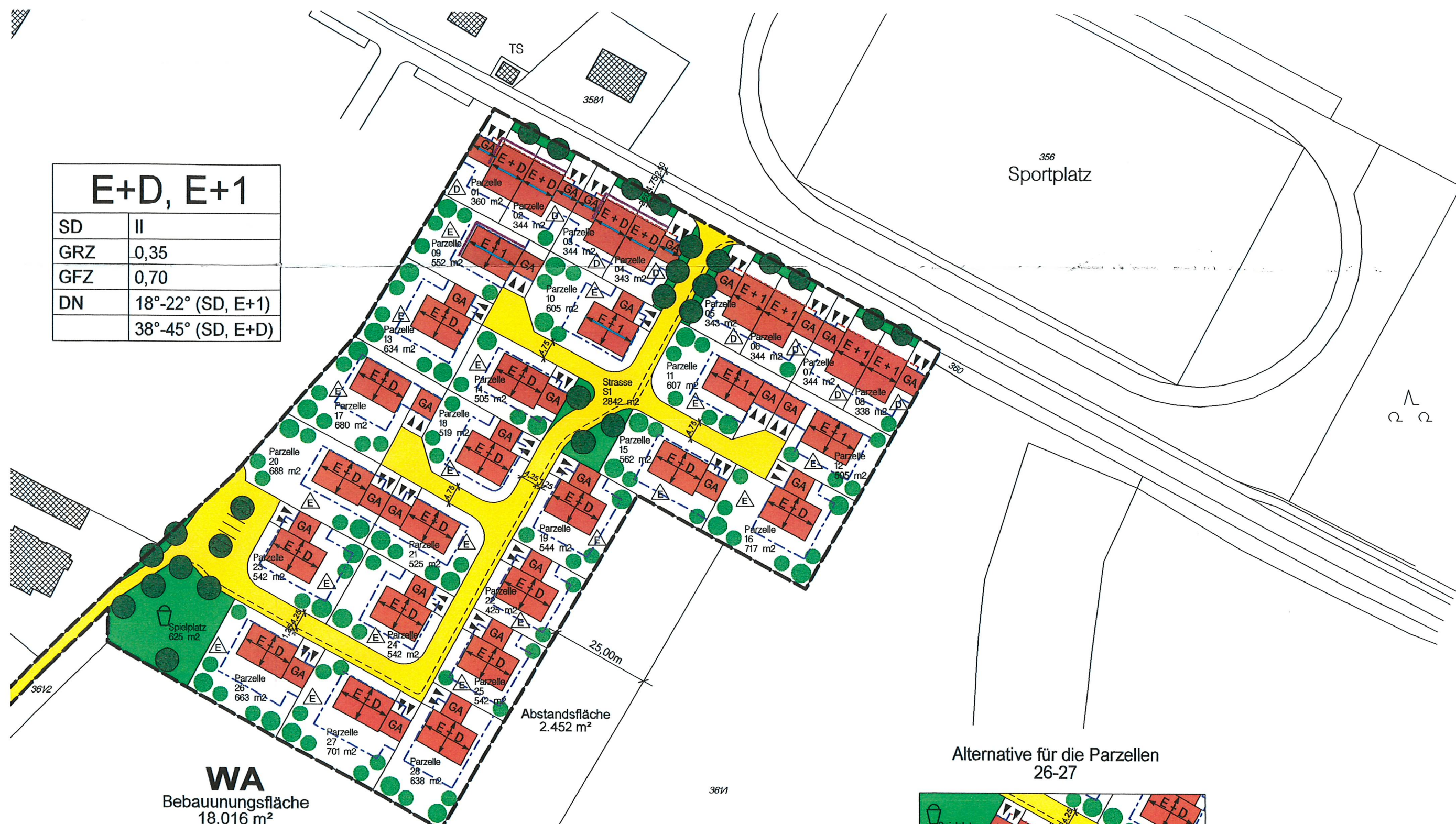
Alternative für die Parzellen 26-27